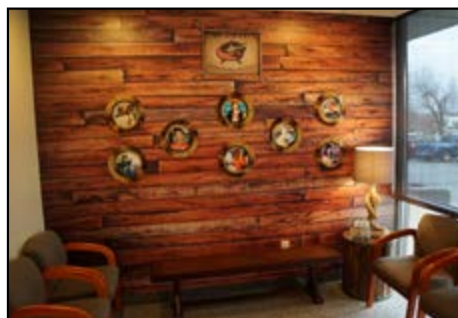
View from the new Lobby

Recently, KidSMILES was featured at the Columbus Blue Jackets Foundation annual fundraiser for its accomplishments. The Lady Blue Jackets, the wives and girlfriends of the players, held their annual fundraiser "Blue Jackets Favorites Basket Auction" and used the proceeds to do an extensive makeover of the KidSMILES clinic. We are extremely grateful to the Columbus Blue Jackets Foundation and the Lady Jackets for their support and partnership that allows us to help the dental needs of Central Ohio children!