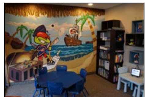
The awesome new Stinger mural