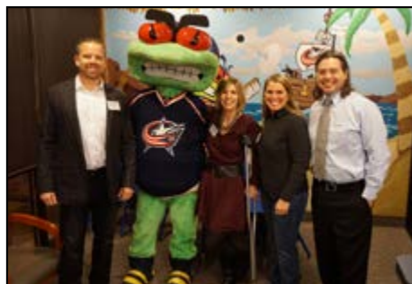
Stinger and some friends