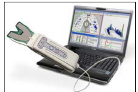
DIGITAL BITE ANALYSIS SOFTWARE

Do you or someone close to you suffer from chronic headaches? New advancements have increased our understanding of the cause behind these headaches. It has been discovered that imbalances in the muscles of the head, neck and jaws overstimulate the headache center of the brain. When this area is overstimulated, then even normal sensations such as stress, light, or smell can trigger the onset of a chronic headache. Many people manage these headaches with pain medication. However, prolonged use of any pain medication is not the answer and actually will make the pain worse over time.