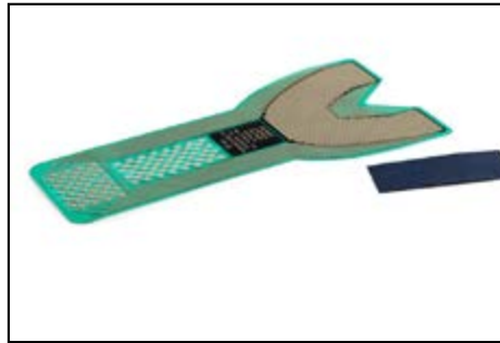
PAPER THIN DIGITAL SENSOR THAT FITS BETWEEN THE TEETH

There are two main causes for the types of muscle imbalances that lead to headaches. The first is traumatic injury to the head and neck; auto accidents are the most common source of these injuries. The second is having a bite that does not fit together properly. When a bite does not fit together correctly, there are small traumas or injuries that occur with every bite. These small traumas add up over time and damage the muscles and joints, putting them out of balance.