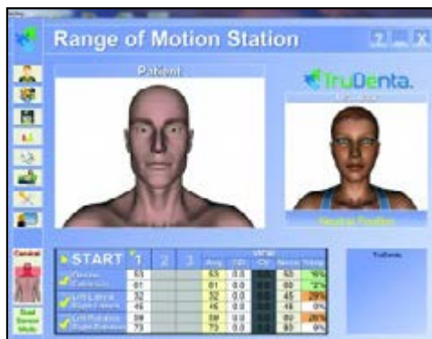
DIGITAL RANGE OF MOTION STUDY

Modern advancements in digital bite analysis have greatly increased our ability to pinpoint traumatic bites. Once detected, these detrimental bite relationships can be corrected. By combining the healing principles of physical therapy to the injured and imbalanced muscles with our ability to create ideal bites, we have found a unique way to naturally cure those pesky chronic headaches without the need for pain medication.