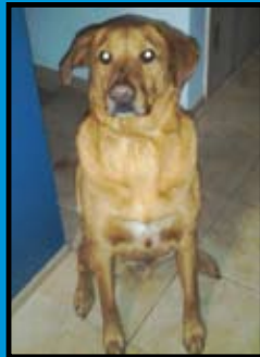
#4 - CODY