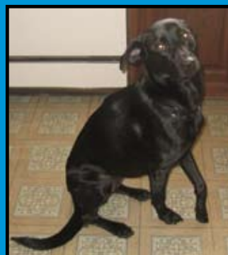
#8 - SOHPIE