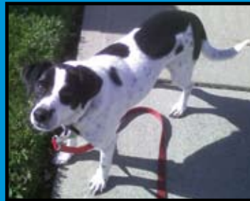
#5 - CHARLIE