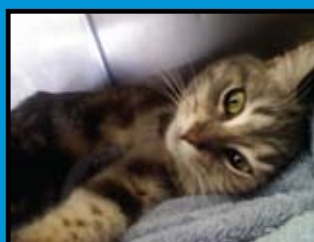
#10 - WHOOSHY