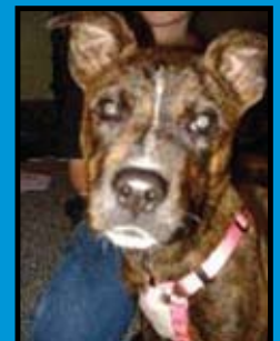
#12 - BELLA