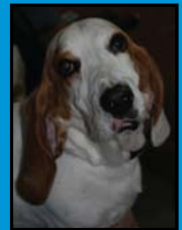
#6 - OMAR