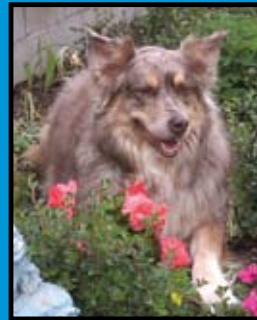
#2 - LOLA