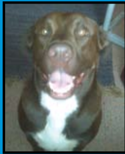
#1 - MAX